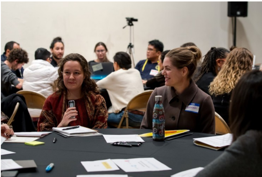
Immigrants. Dance. Arts. Conference

Join Dance/NYC for a free, day-long series of convening presented in partnership with the New York City Mayor's Office of Immigrant Affairs and The Kupferberg Center for the Arts at Queens College with performances curated by Queens Theatre.