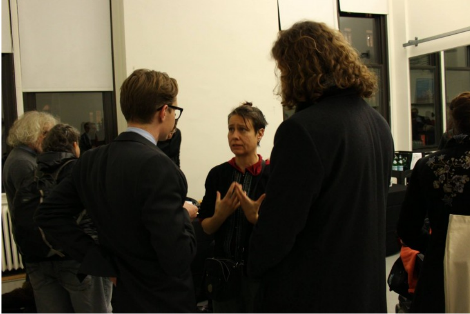
Town Hall: Disability and National Synergies in Dance.