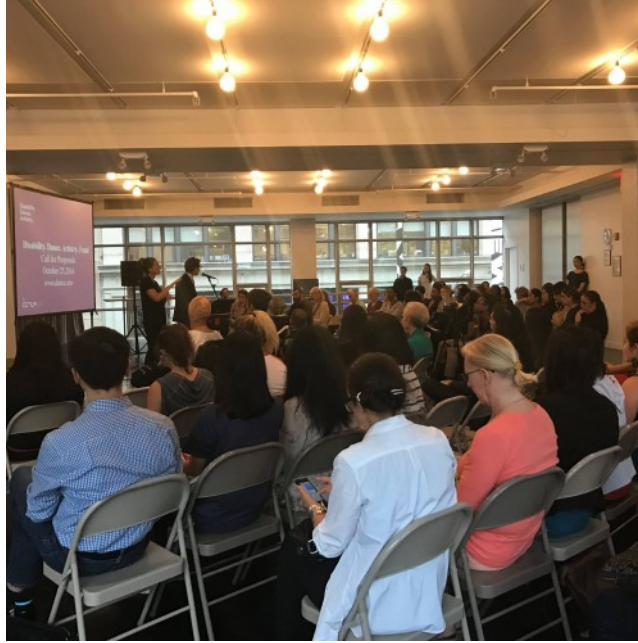
Town Hall: Disability, Race, and the Practice of Dance.