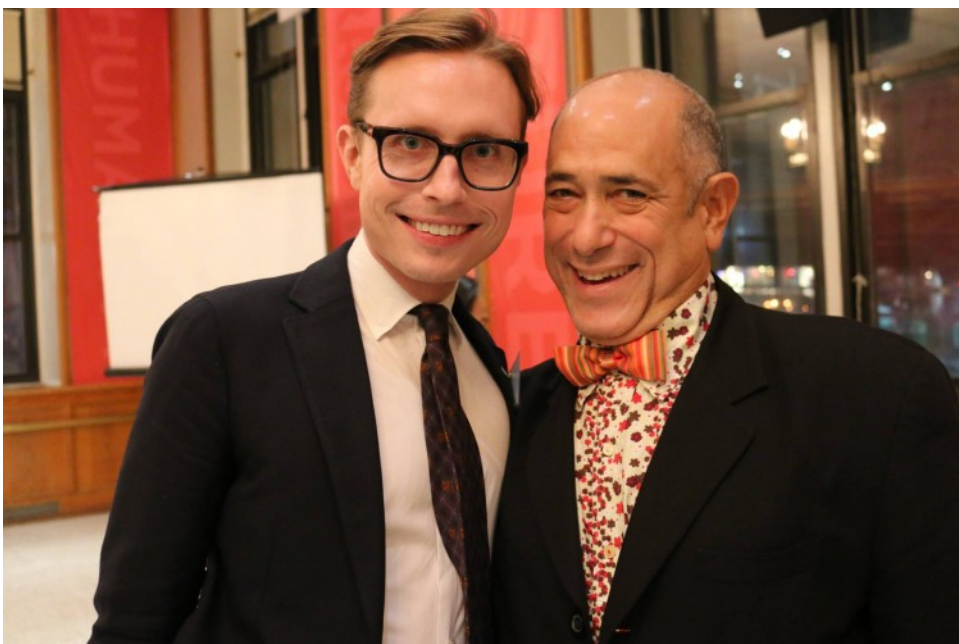
Town Hall: Dance Educators and Disability.