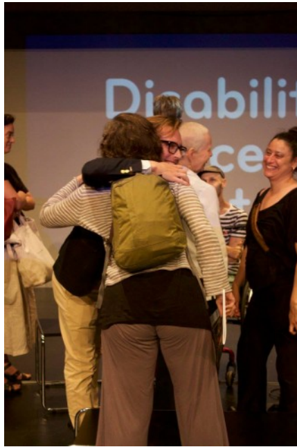
Town Hall: Dance Makers on Disability.