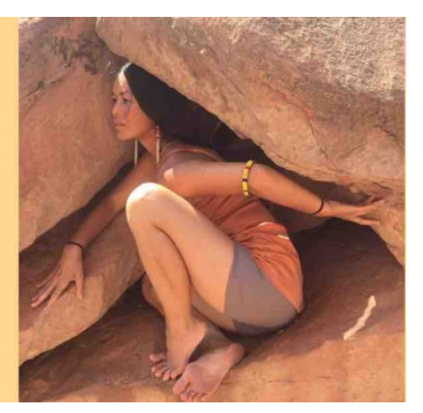
NAI-NI CHEN DANCE COMPANY